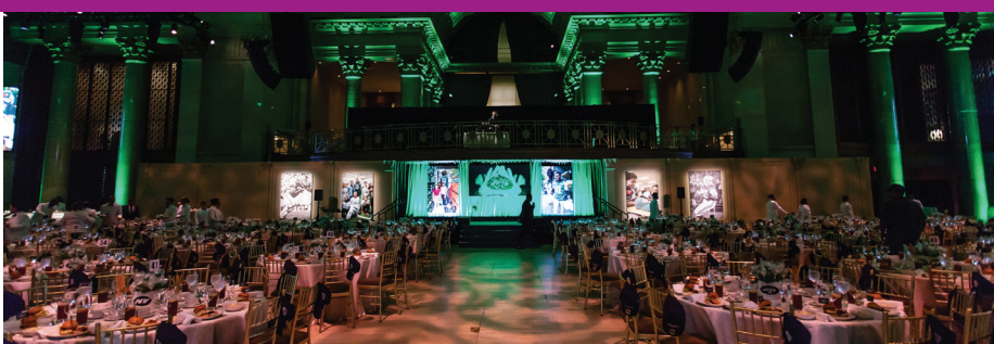
18th Annual Jets Kickoff Luncheon

The New York Jets hosted their 18 th Annual Jets Kickoff Luncheon at Cipriani Wall Street on August 28, 2018 – and raised over $750,000 to benefit the New York Jets Foundation and the Lupus Research Alliance. They also gave cheering fans – nearly 800 generous supporters – a glimpse of the upcoming year.