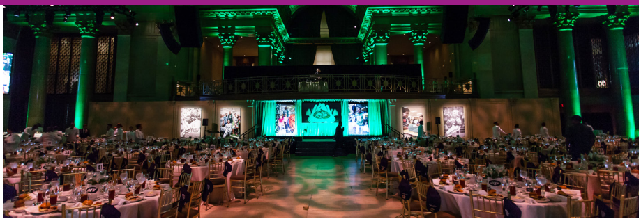
18th Annual Jets Kickoff Luncheon